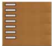
Left Stacked Vertical Column 24" x 6"