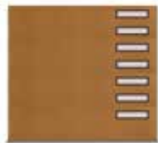
Full Section Stacked