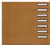
Right Stacked Vertical Column 24" x 6"