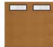
Top Section 38" x 14" or 26" x 14"

Note: Bottom section window will only be installed on the top of the section.