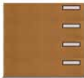
Top Section Stacked