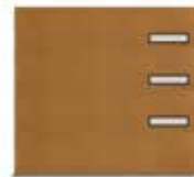
Bottom Section Stacked